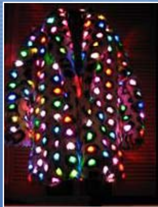
Coat with lights