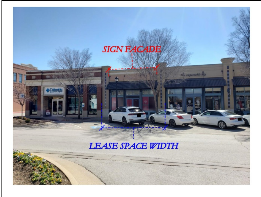
Measuring width of a single plane façade and lease space